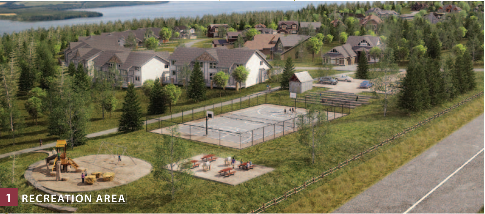
1 RECREATION AREA

Illustrations are for representation only. Developer reserves the right to make changes.