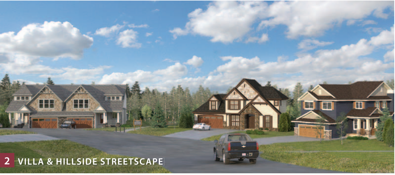
2 VILLA & HILLSIDE STREETSCAPE