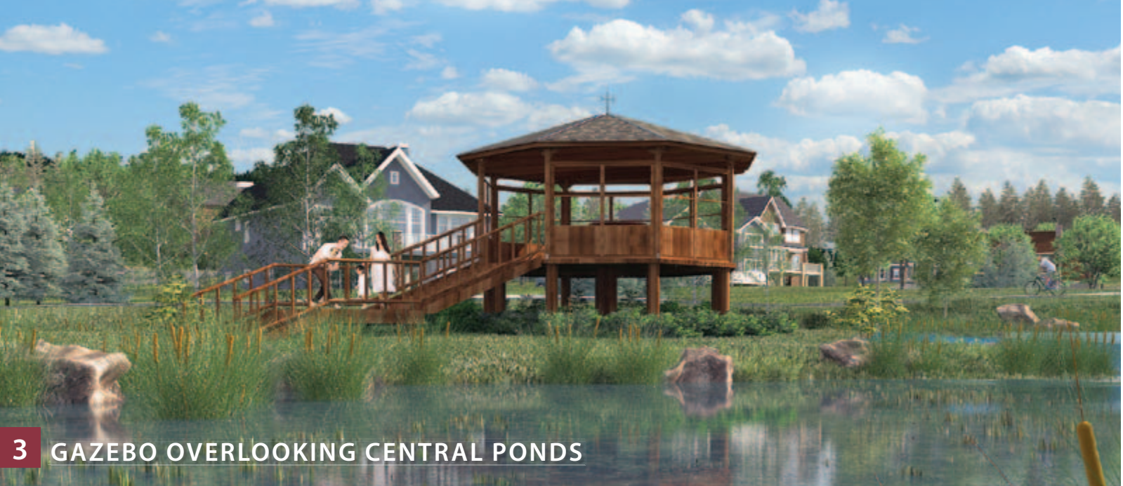
3 GAZEBO OVERLOOKING CENTRAL PONDS