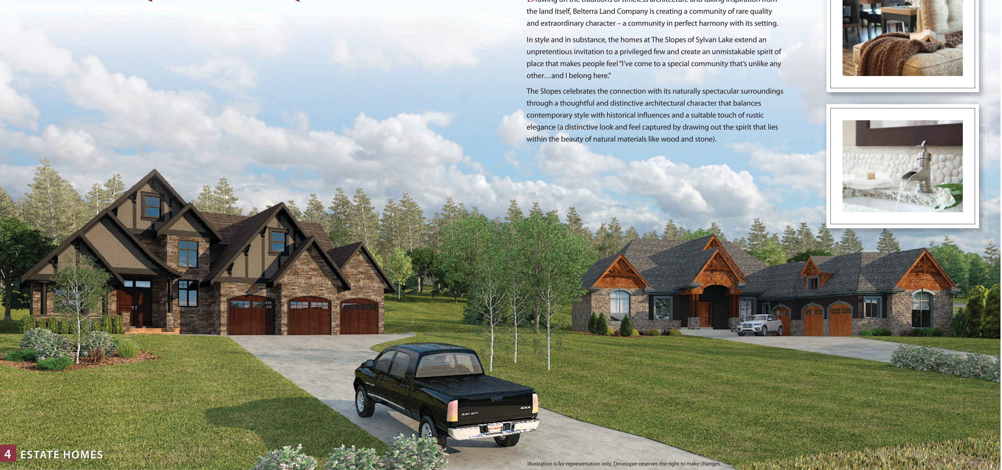
4 ESTATE HOMES

CRAFTSMAN » The distinguishing characteristics of this style include moderate pitched roofs with dormers, covered front verandas, decorative beams or braces, and traditional building materials in deep, rich colours. Masonry is essential to this style, though it is typically used as a base element to ground the home and create a sense of stability.