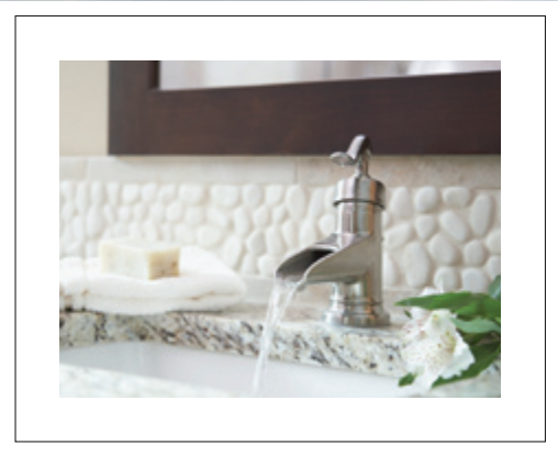
Illustration is for representation only. Developer reserves the right to make changes.